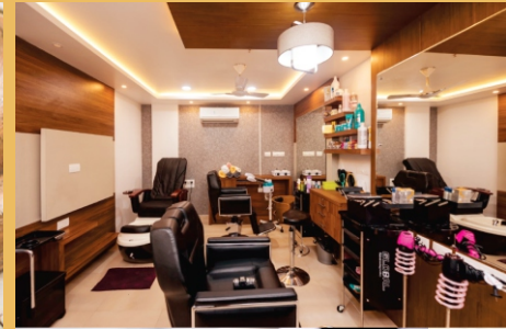
▶ Beauty Parlor