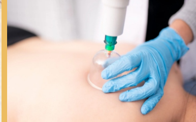
▶ Cupping Therapy