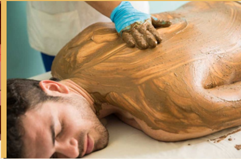
▶ Mud Therapy