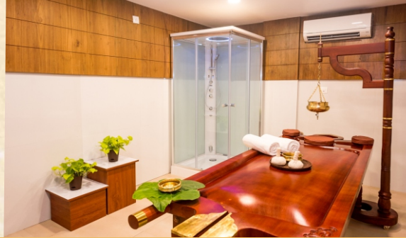
▶ Ayurveda & Panchakarma